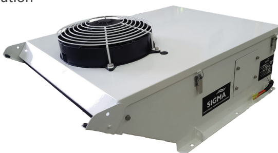
Rooftop Package Unit