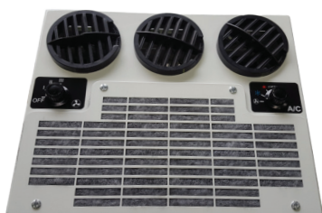
Underceiling Control Panel